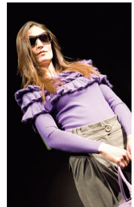
A model during the fashion show.