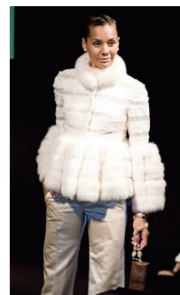
A model in Dennis Basso.