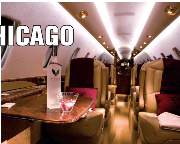
The interior of the CitationShares jet with Frette pillows and pajamas and VeeV vodka.